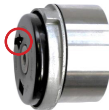
Fig. 2: Locating tab on the back of Gates tensioner. Place in relief on engine to properly locate timing belt tensioner.