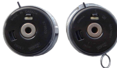
Fig 1: Gates Tensioner T43143 on the left, OE GM Tensioner on the right; viewed from the back side.